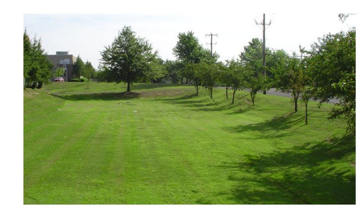
grassed detention area with open space and trees