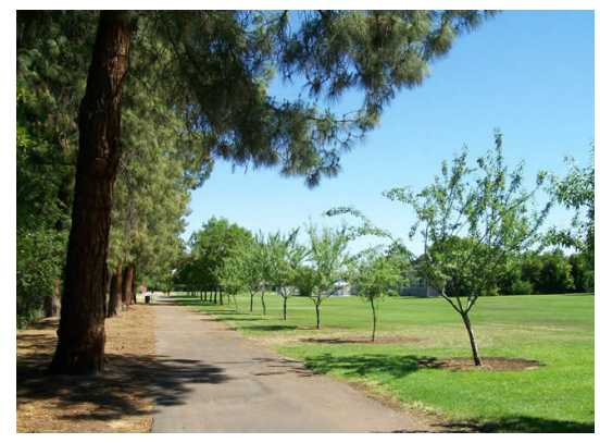
trees allowing views into the reserve