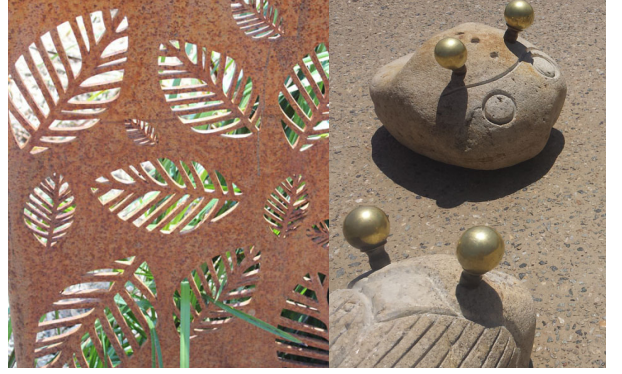
potential to include art works in landscape