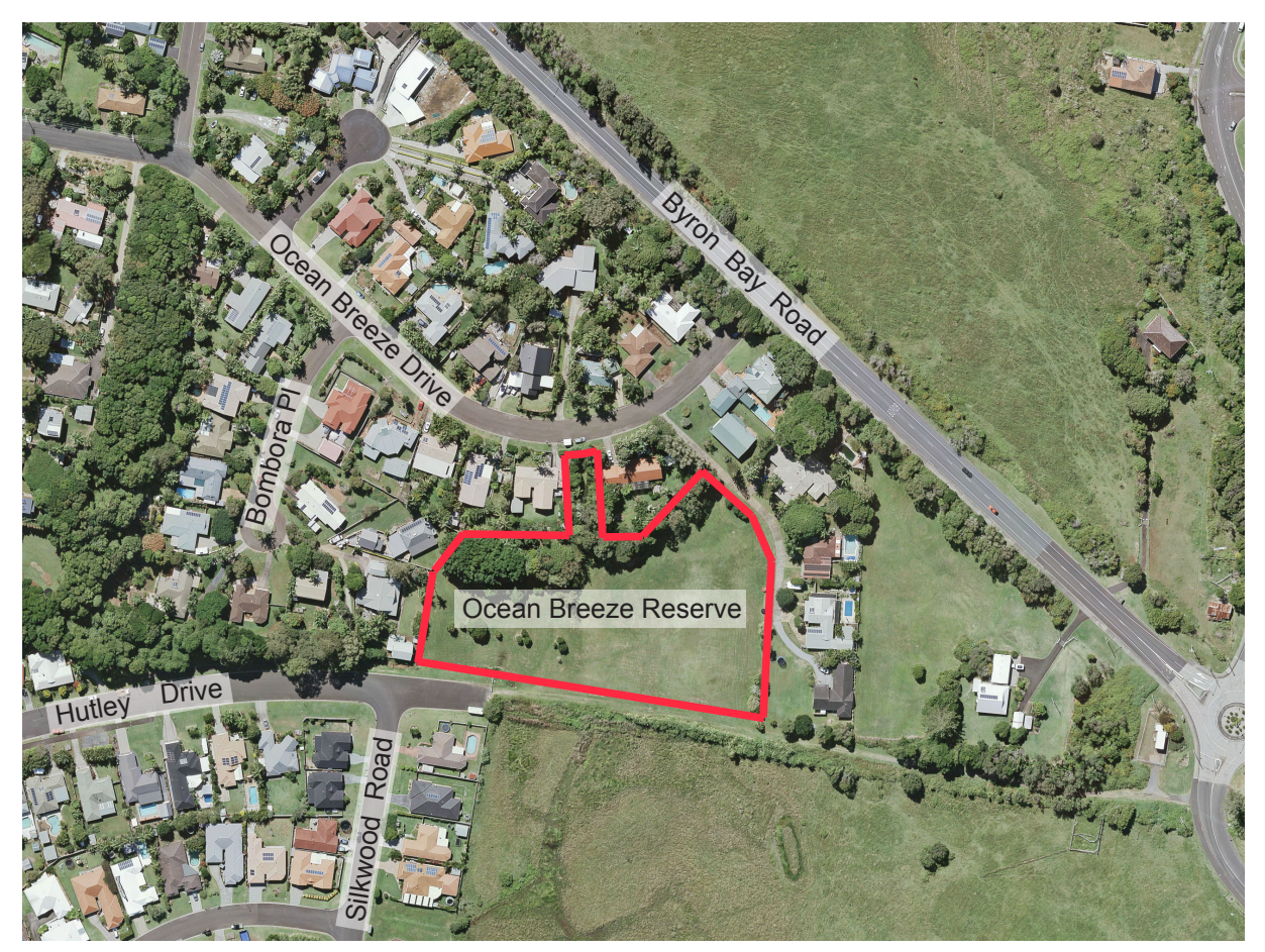
Figure 1: Ocean Breeze Reserve

In late 2016, Ballina Shire Council commissioned the preparation of a Master Plan for the Ocean Breeze Reserve. This 1.24 hectare reserve is between Hutley Drive and Ocean Breeze Drive at Lennox Head. The Ocean Breeze Reserve Master Plan will be incorporated into Ballina Shire Council's Plan of Management for Community Land.