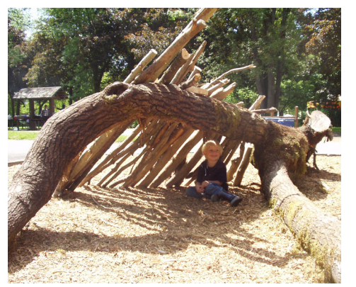
childrens play area with nature based play elements, mounds, planting, slide and timber swing