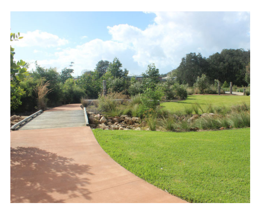
path providing link through reserve