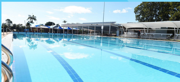
Alstonville Aquatic Centre

Ballina War Memorial Pool and Alstonville Aquatic Centre were redeveloped in 2018, providing modern aquatic facilities that will be enjoyed for future decades.