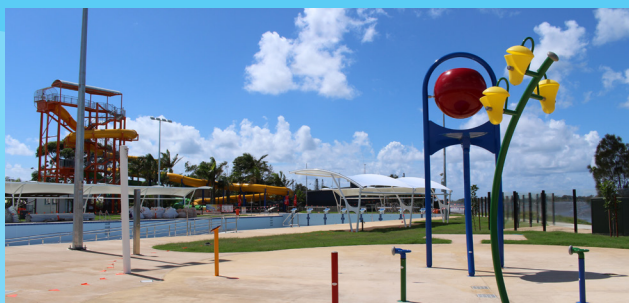
Ballina War Memorial Pool