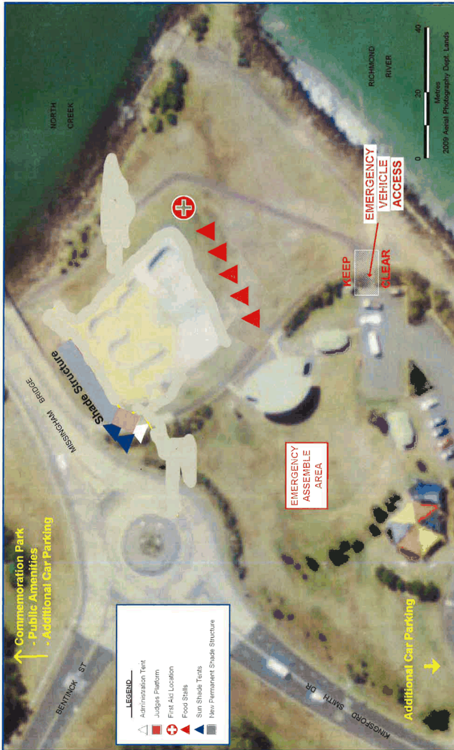
2015 Ballina Fair Go Site Plan