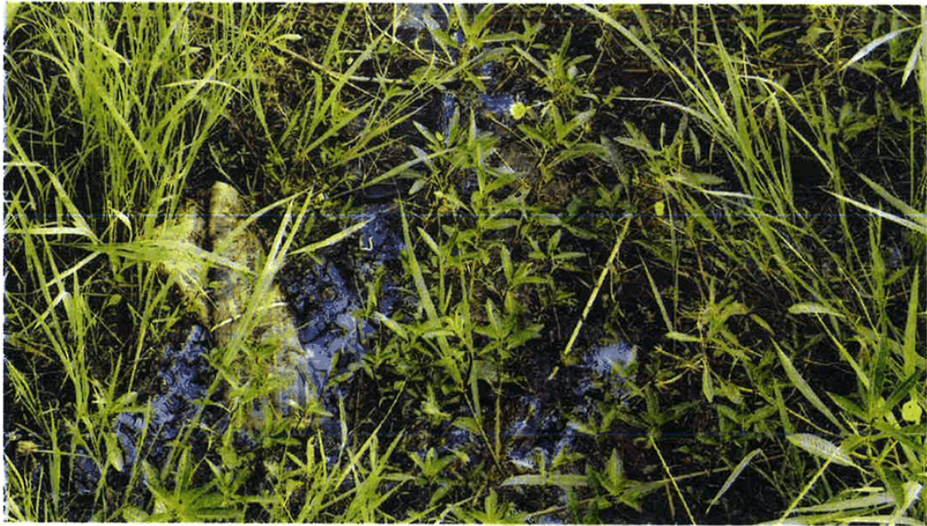
② STAGNANT WATER IN ABOVE DRAIN