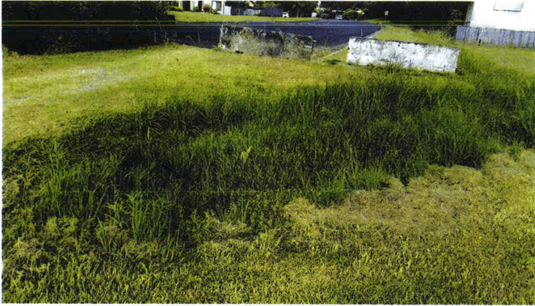
① DRAIN FOR QUEEN BREEZE RESERVE