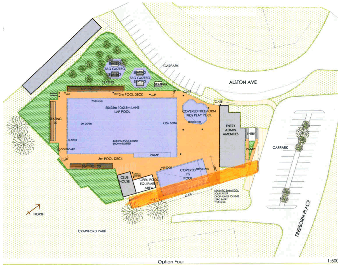
Option Four 1:500