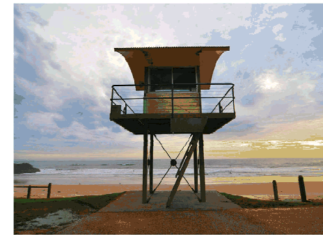
IMAGE OF SIMILAR SURF LIFE SAVING OBSERVATION TOWER

L:\2011_2012\11_Sharpe_Beach\11_Sharpe_Beach_Site_Plan.dwg