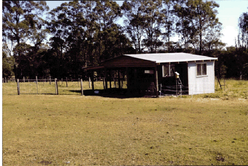
Image 1 - External view of animal shelter