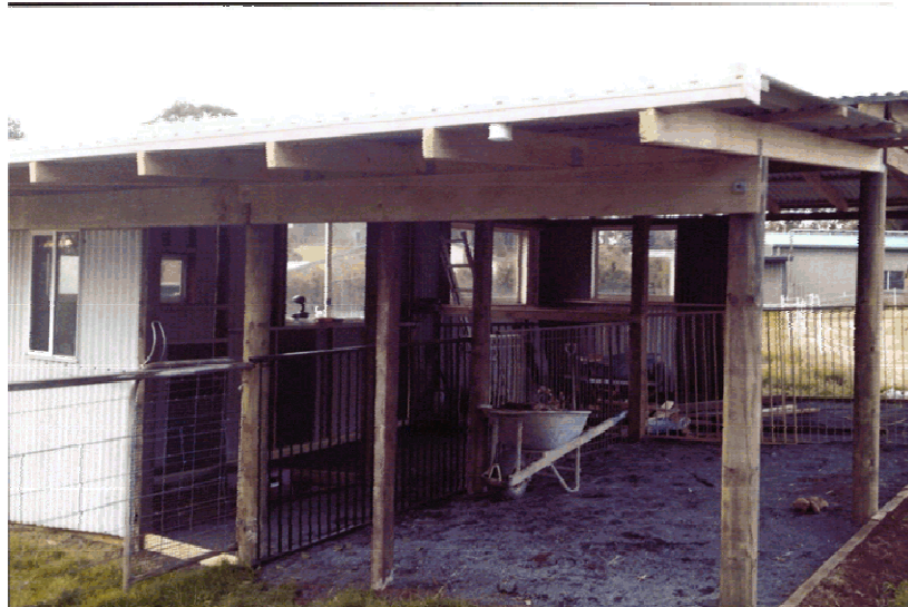
Image 2 - Internal view of animal shelter

Note: colour bond shed in distance is located on the adjoining property