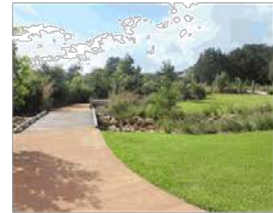
path providing link through reserve