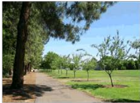
trees allowing views into the reserve