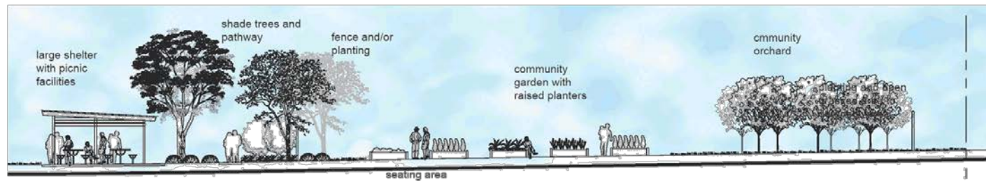
Master Plan Cross Section Large shade shelter, path, tree planting and community garden