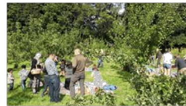
community garden with vegetable gardens, orchard, native food trees and work area