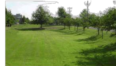
grassed detention area with open space and trees