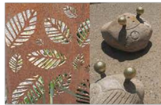
potential to include art works in landscape