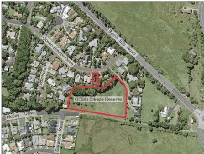
Figure 1: Ocean Breeze Reserve

In late 2016, Ballina Shire Council commissioned the preparation of a Master Plan for the Ocean Breeze Reserve. This 1.24 hectare reserve is between Hutley Drive and Ocean Breeze Drive at Lennox Head. The Ocean Breeze Reserve Master Plan will be incorporated into Ballina Shire Council's Plan of Management for Community Land.