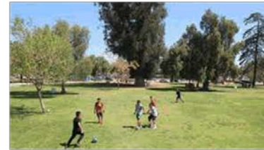
open space retained for informal play