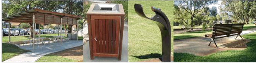
large shelter for group gatherings, picnic facilities, park furniture and seating in shaded locations