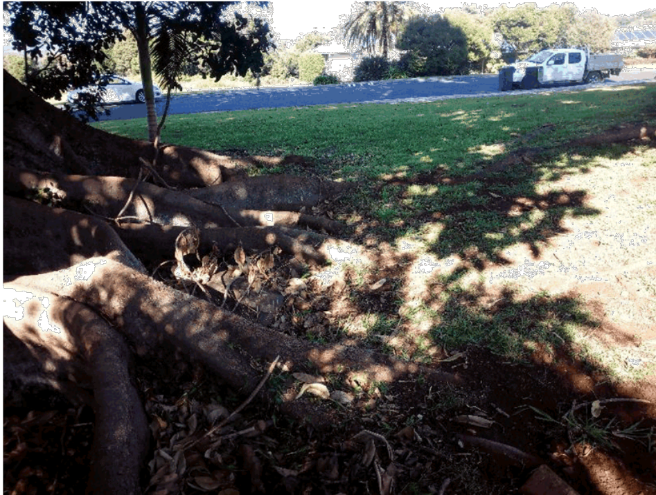
150749 2015-08-19 V1 Ballina SC Subsidence-Tree Root Damage