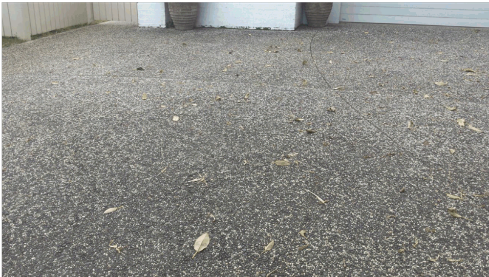
Photo No. 4 – Reflected cracking across a joint in the driveway slab.