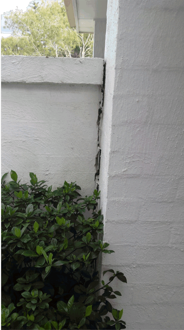
Photo No. 7 – Rotation of the brick privacy wall on the western side of the garage as evident from the gap that has opened up in the vertical joint.

Registered Professional Engineer of Queensland