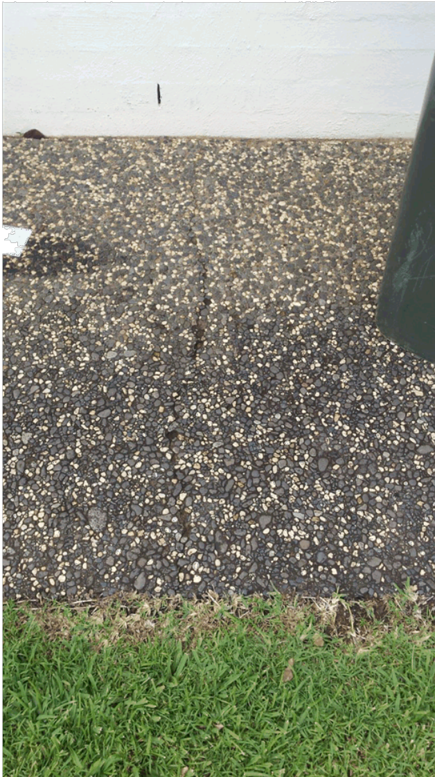
Photo No. 9 –A crack in the 1.3 metre wide concrete path on the western side of the house

Registered Professional Engineer of Queensland