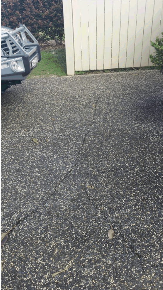
Photo No. 2 – Typical cracking of the concrete driveway slab abutting the garage floor slab.

Registered Professional Engineer of Queensland