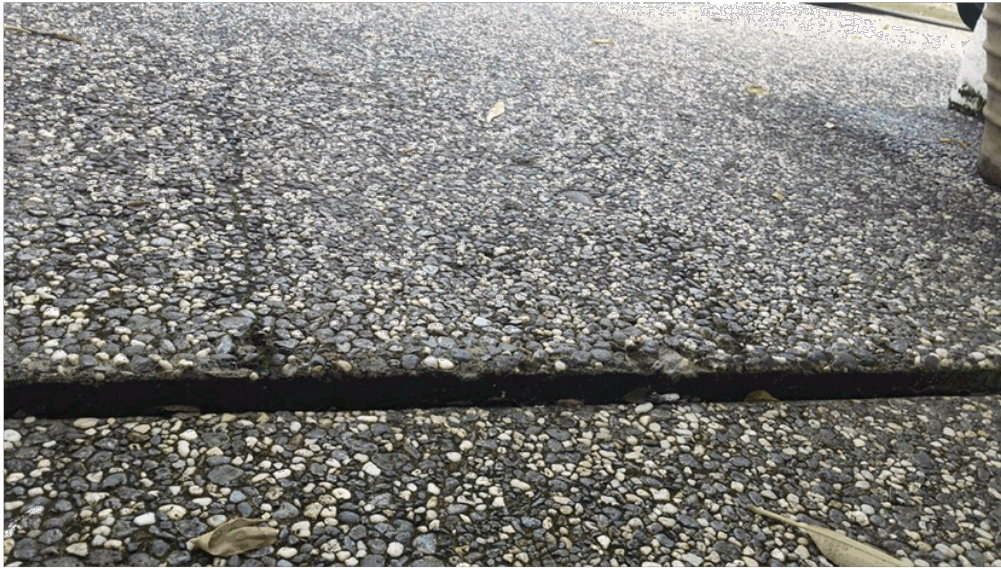
Photo No. 3 – Lifted concrete driveway slab abutting the garage floor slab. Note the presence of cracks.

Registered Professional Engineer of Queensland