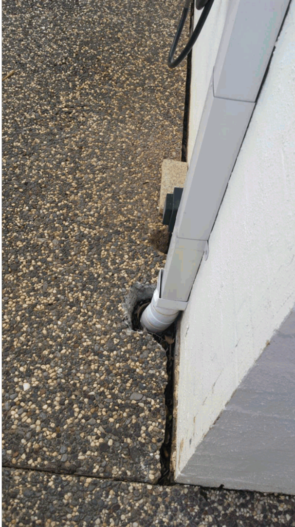
Photo No. 8 – Separation of the 1.3metre wide path from the wall on the western side of the house

Registered Professional Engineer of Queensland