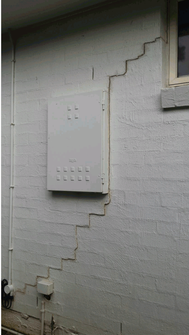
Photo No. 10 – Cracking in the brick wall at the south-eastern corner of the house.

Registered Professional Engineer of Queensland