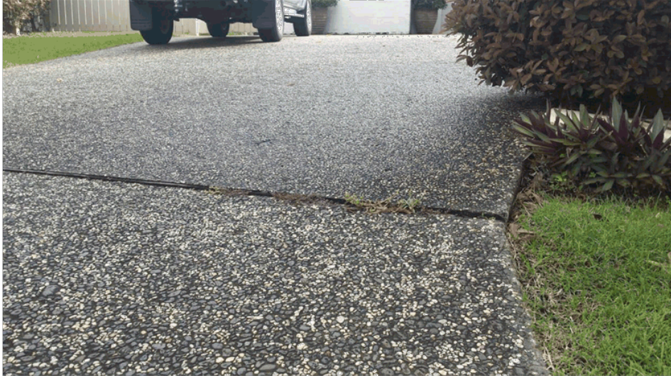
Photo No. 5 – A step in a contraction joint in the driveway slab at the property boundary.

Registered Professional Engineer of Queensland