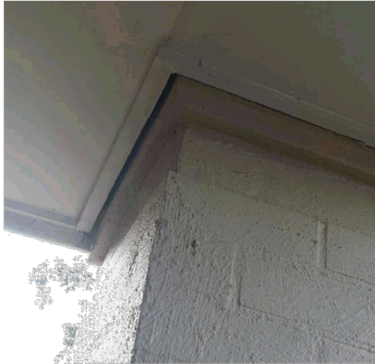
Photo No. 1 – Leaning brick pillar at the entry to the house as photographed on 6 April 2017.

Registered Professional Engineer of Queensland