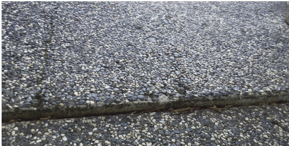
Photo No. 4 – Lifted concrete driveway slab abutting the garage floor slab as photographed on 27 April 2018 when the step at the joint was measured at 35mm high.