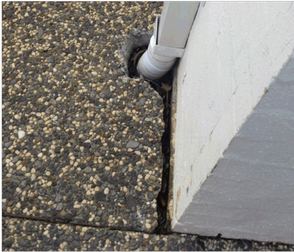
Photo No. 9 – Separation of the 1.3metre wide path from the wall on the western side of the house as photographed on 6 April 2017

Registered Professional Engineer of Queensland