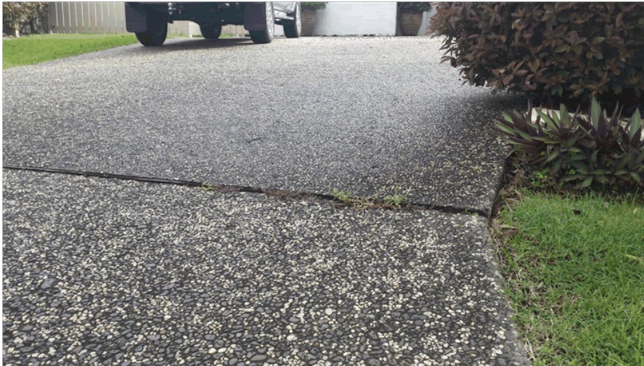
Photo No. 5 – A step in a contraction joint in the driveway slab at the property boundary as photographed on 6 April 2017.

Registered Professional Engineer of Queensland