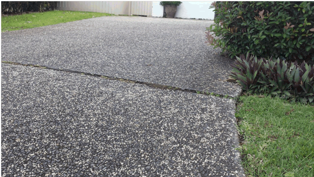
Photo No. 6 – The step in the contraction joint in the driveway slab at the property boundary as photographed on 27 April 2018 did not exhibit any significant change over the past 12 months.