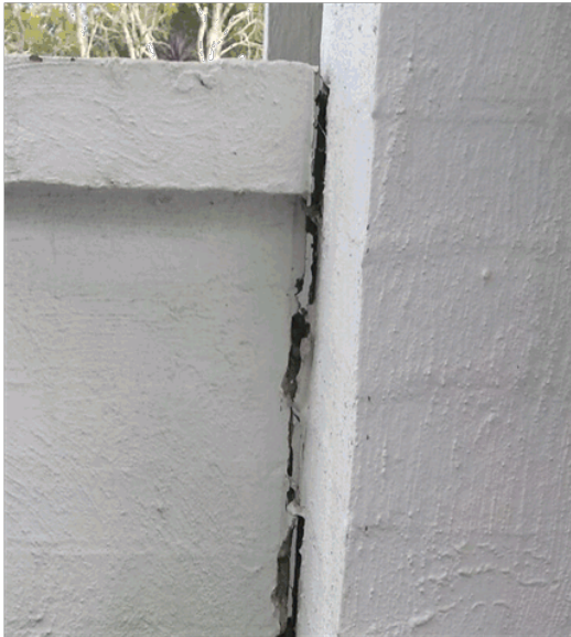
Photo No. 7 – As photographed on 6 April 2017, lifting and rotation of the brick privacy wall on the western side of the garage had opened up a gap in the vertical joint with the house.

Registered Professional Engineer of Queensland