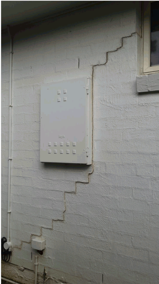
Photo No. 11 – Cracking in the brick wall at the south-eastern corner of the house as photographed on 6 April 2017.

Registered Professional Engineer of Queensland