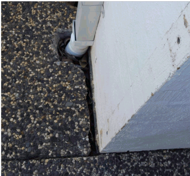
Photo No. 10 – Separation of the 1.3metre wide path from the wall on the western side of the house as photographed on 27 April 2018. The does not appear to have been any significant change since April 2017.