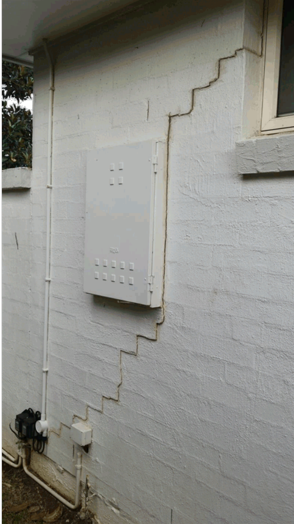
Photo No. 12 – Cracking in the brick wall at the south-eastern corner of the house as photographed on 27 April 2018. This crack does not appear to have deteriorated over the past 12 months.

Registered Professional Engineer of Queensland