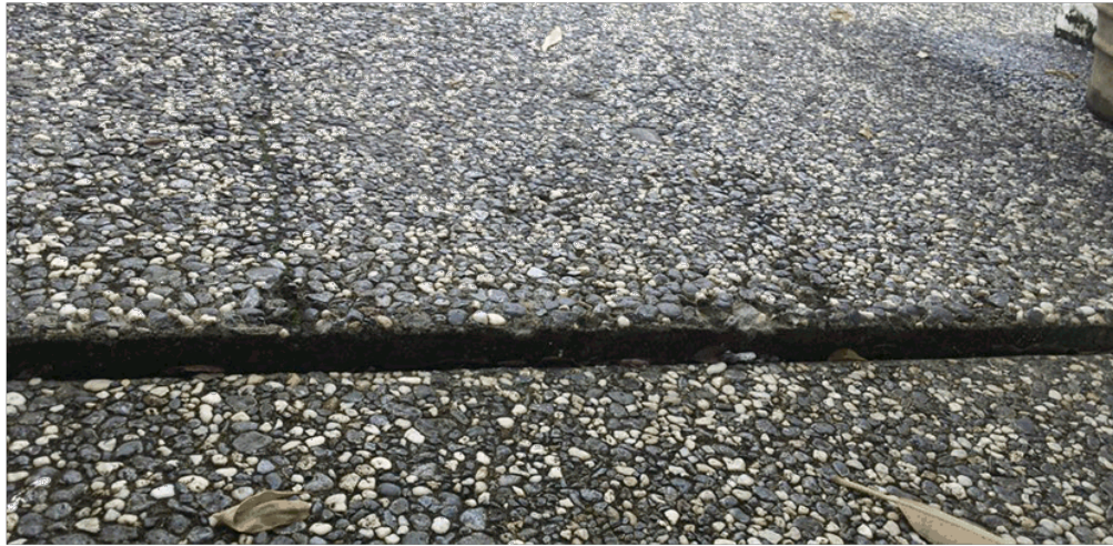
Photo No. 3 – Lifted concrete driveway slab abutting the garage floor slab as photographed on 6 April 2017. At the time the step at the joint was measured at 25mm high.

Registered Professional Engineer of Queensland