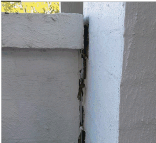
Photo No. 8 –The vertical joint between the brick privacy screen and the house as photographed on 27 April 2017. This joint has widened by about 4mm and the privacy screen has lifted by about 10mm over the past 12 months.