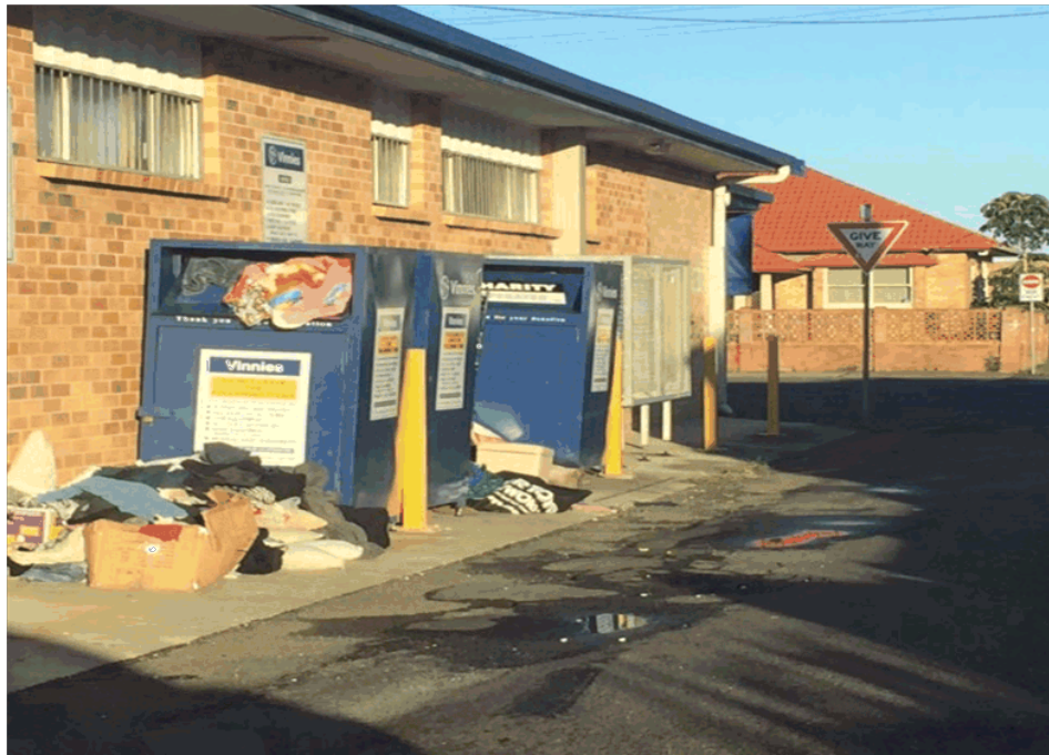
Monday 6 2017, 9.25am and 10.25am