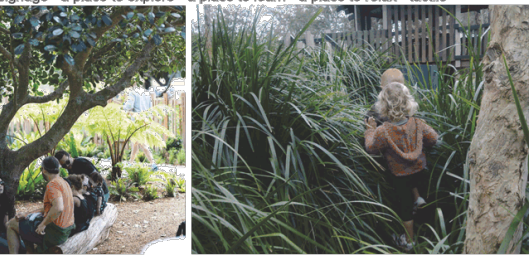
Above left: Wild Play area by Ian Potter, Above right: My children exploring a native garden

Steeper land planted with local rainforest plants supported by interpretative signage - a place to explore - a place to learn - a place to relax - tactile