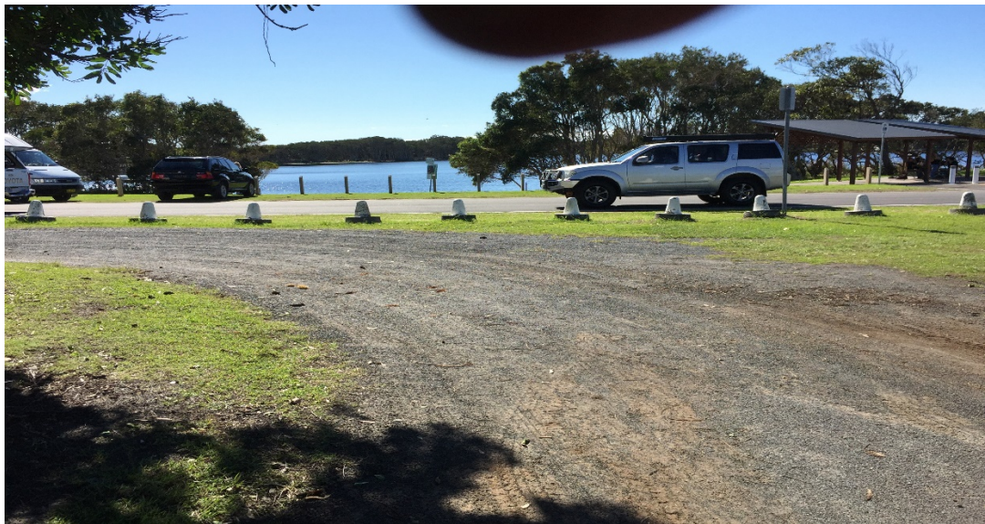
Fig 1 Northern boundary of CP where it is directly aligned between Ross/Gibbon Streets with the SW beach.