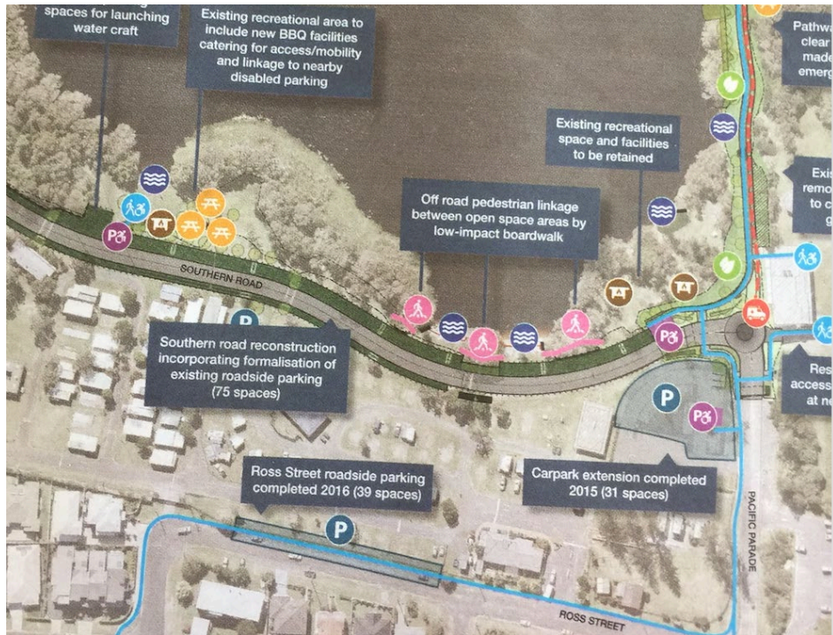
Fig 2 Council Proposed Pedestrian route from Gibbon St to north (pale blue).