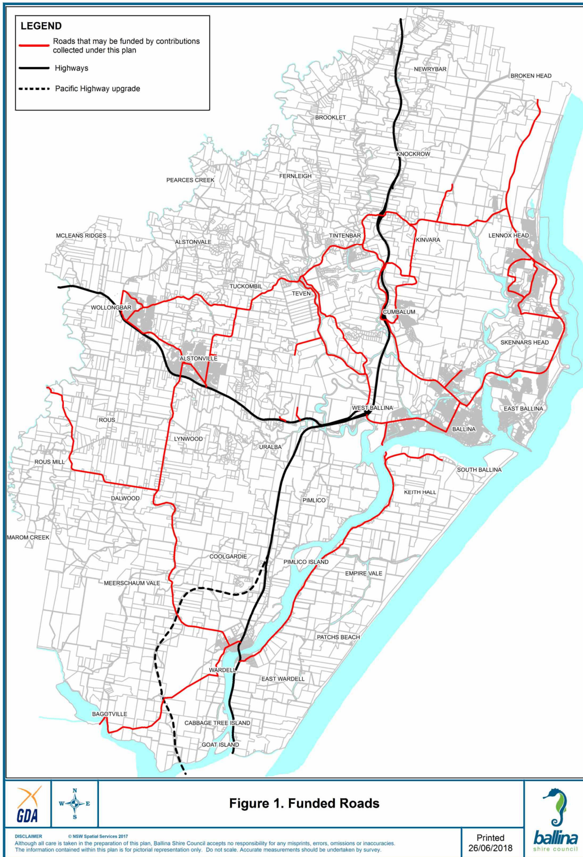
Figure 1 Funded Roads