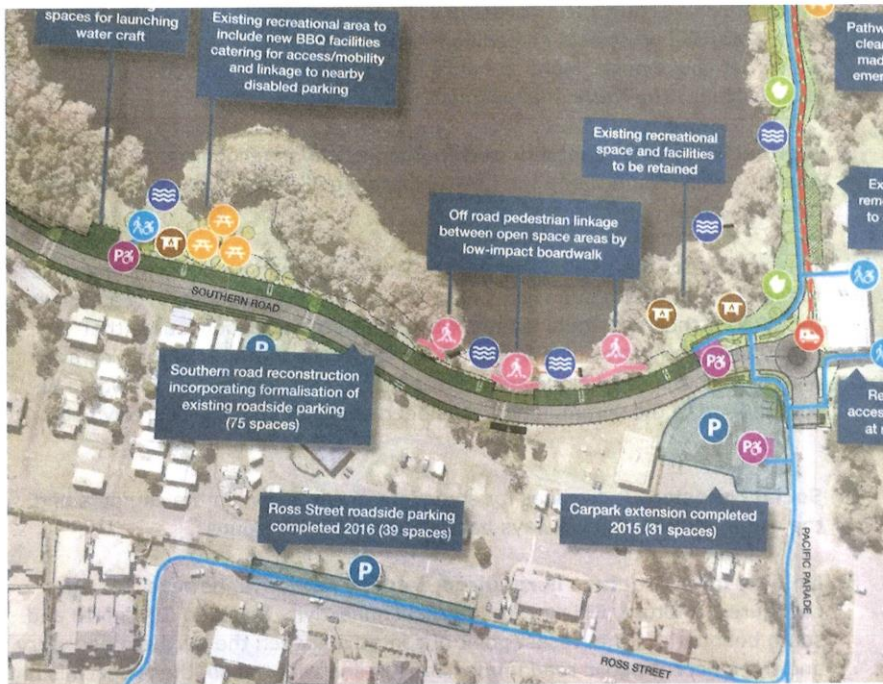
Fig 2 Council Proposed Pedestrian route from Gibbon St to north (pale blue) is a long hike around the caravan park.