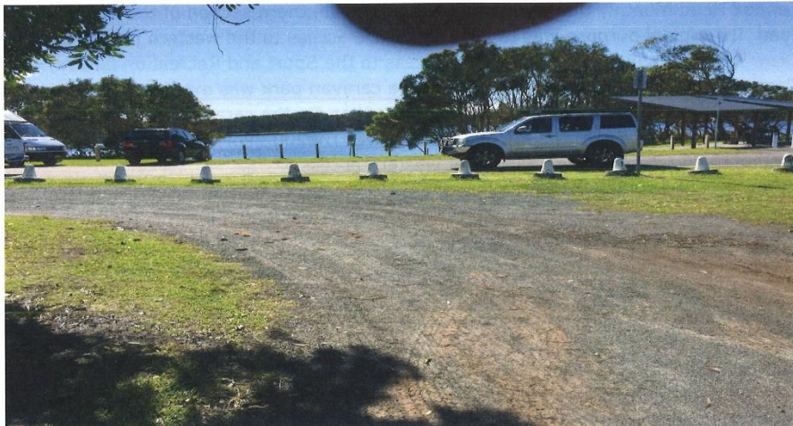
Fig 1 Northern boundary of CP where it is directly aligned between Ross/Gibbon Sts with the SW beach.