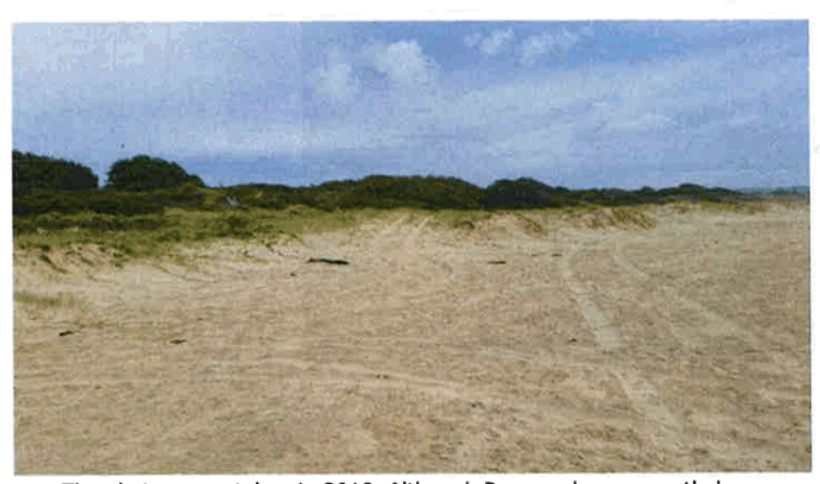
The photos were taken in 2019. Although Rangers have recently been active at Seven Mile there is no possibility of preventing this habitual behaviour without 24/7 surveillance. The rule is not enough.

There will always be drivers who do not obey this rule. Furthermore, the requirement to remain 10m from dunal vegetation is difficult for a driver to estimate and an unexpected high wave can force drivers too close.