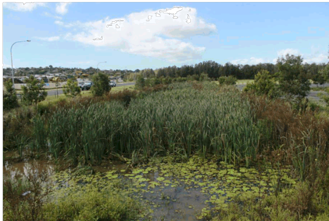
Constructed wetlands and other waterbodies in water sensitive design elements may create opportunities for mosquitoes

One strategy to be considered is the incorporation of permanent or temporary signage advising visitors that mosquitoes are present and a health threat. These signs could also include advice on person protection measures. Temporary signs could be updated over the course of the year and only be installed during peak periods or when mosquito surveillance identifies a higher risk of pest or public health impacts.