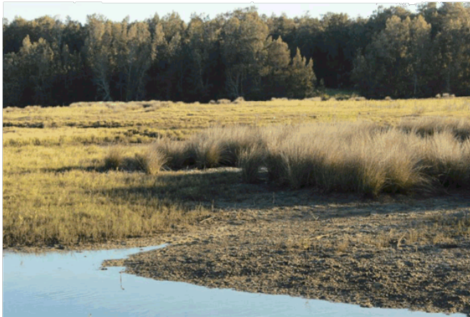
Coastal wetlands in the Ballina Shire region can provide habitat for a range of mosquitoes including the key nuisance species, Aedes vigilax