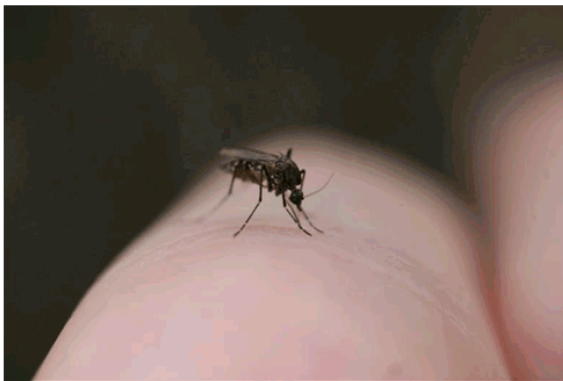
One of the most common nuisance-biting mosquitoes in the Ballina Shire region is Aedes vigilax , a mosquito associated with tidally influenced wetlands such as mangroves, saltmarshes, and sedgeland.

The management of Aedes notoscriptus is a challenge for local authorities around Australia. While mosquito control programs are effectively established in wetland areas, there are generally no programs targeting mosquitoes associated with backyard habitats. The exception is in Far North Queensland where control of Aedes aegypti , a species that shares these water-holding container habitats, is undertaken in response to the threat of local DENV transmission. Studies from QLD, NSW, and WA indicate that Aedes notoscriptus can still be an important pest but reducing local mosquito abundance is reliant on increasing awareness among the community and changing behaviours that do not encourage the creation or maintenance of local mosquito habitats. In addition, the nuisance biting of this mosquito can often drive complaints from residents in and around urban wetlands where nuisance-biting by this mosquito is perceived to be due to mosquitoes emerging from local wetlands. For this reason, mosquito monitoring around proposed or newly constructed wetlands can assist in assessing mosquito species-specific and/or habitat specific pest risk and implementation of mitigation strategies. However, disassociation of these pest impacts from the local wetlands is equally important and in these instances, community education programs may hold much greater potential in reducing pest mosquito impacts than mosquito control initiatives.