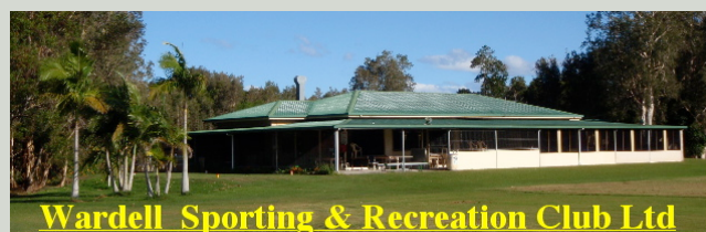
Wardell Sporting & Recreation Club Ltd