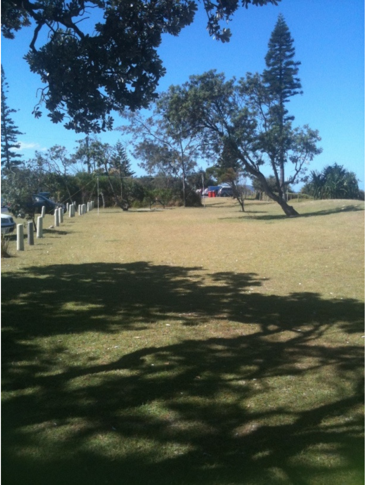
Site 2 - Corner of Ross Street & Pacific Parade