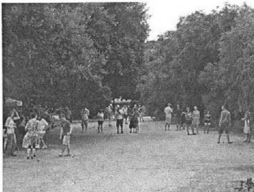
Players at Centennial Park, Sydney