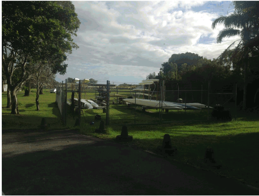
The existing site used by the club