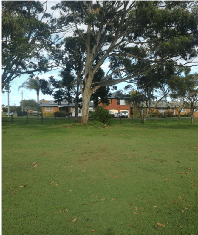
View towards Cawarra Street from the existing site