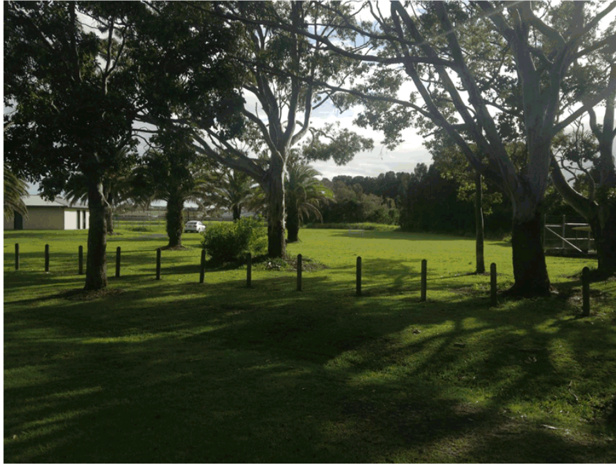
The proposed area – view from the street