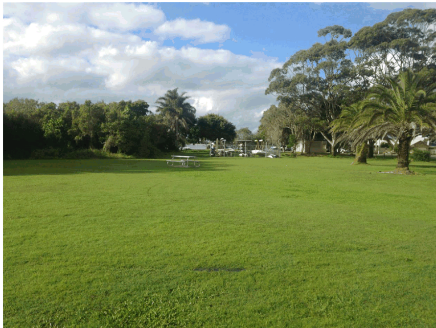
The proposed area – view to the river