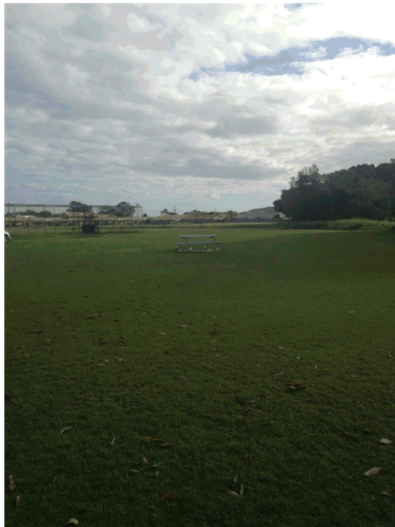
Proposed area – view from existing site