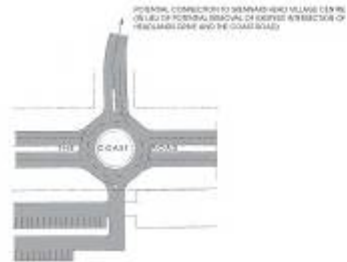
POSSIBLE LONG TERM INTERSECTION CONFIGURATION 1:1000 @ A1