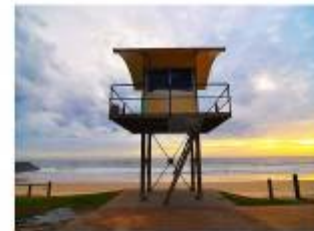
IMAGE OF SIMILAR SURF LIFE SAVING OBSERVATION TOWER