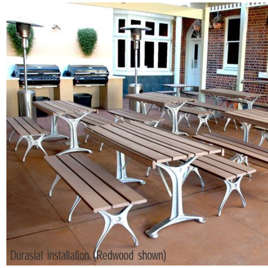
Table Model: UT11 (wheelchair accessible) Bench Seat Model: BS1 Battens: Duraslat Grey (composite hardwood and non-toxic PVC) Upper support and legs: Powdercoated cast aluminium (Dulux 'Citi Pearl') Mounting: Surface mounted

Manufacturer: Botton & Gardiner Skatestoppers are available as a plant attachment.