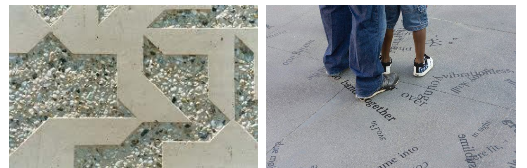
Images of sandblasted concrete and pavement art

The foreshore pathway could contain panels with information themed around the surf culture in Lennox Head. For example, the names of prominent local surfers, the local names for surfing locations ('The Reef', 'The Point' etc.), surfing terminology and so on.