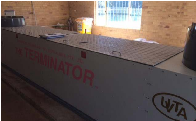
UV radiation acts as a tertiary treatment to disinfect the water.