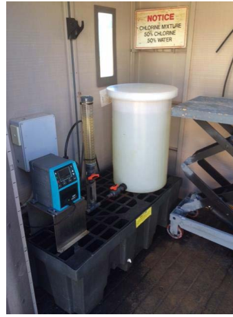
Chlorine is added to the water to fight any bacteria it may come into contact with before re-use.