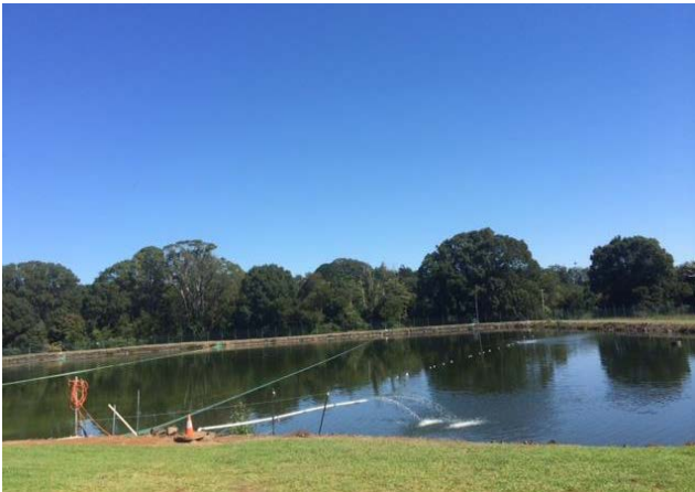
Balancing ponds store the water before being reused for irrigation purposes.