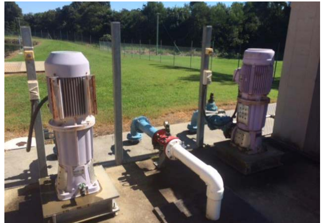
Pumps then send the recycled water to a reservoir where it is gravity fed to the following on-farm storages for irrigation purposes: