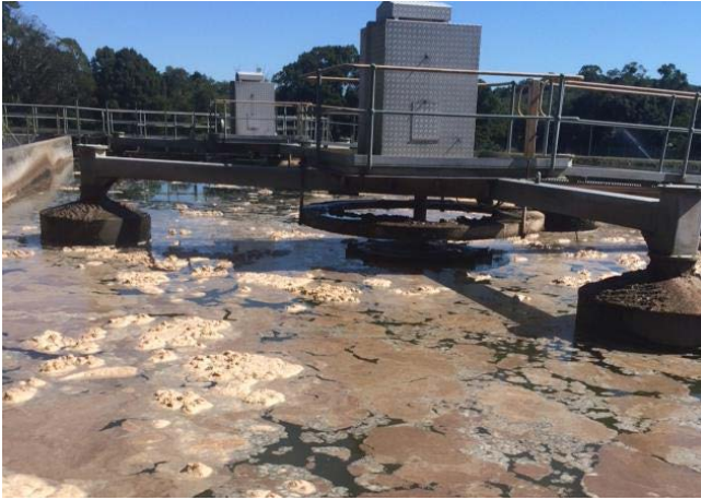
Aeration tanks regularly decant the water leaving the sludge behind.