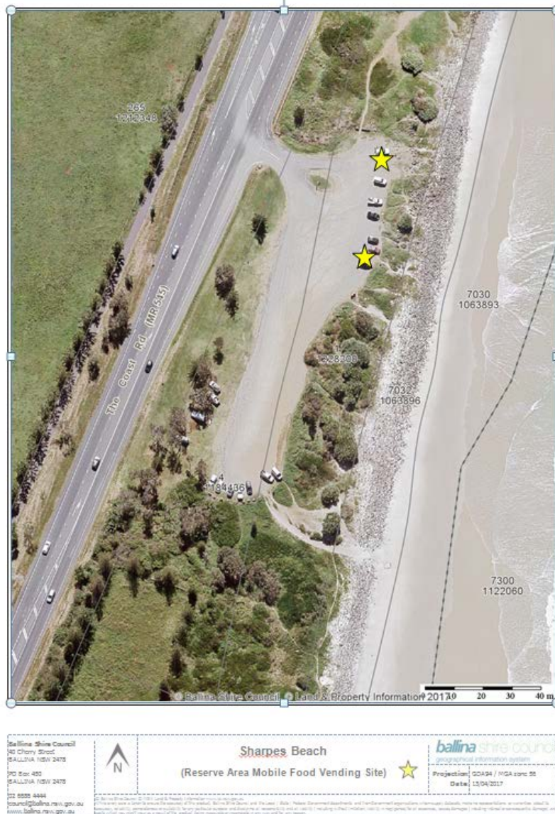
Figure 2 – Proposed Reserve Area Mobile Food Vending Site

Under the current policy, a mobile food vending permit holder is allowed to trade within 20m of a nominated site on a reserve to provide for flexibility for traders in the event that an on reserve site is occupied.