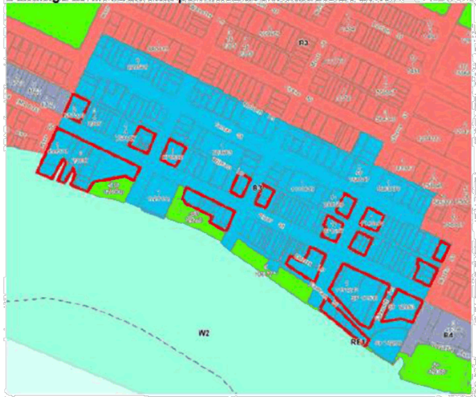
Diagram 1 – Sites (outlined in red) proposed to permit residential flat buildings as an additional permitted use within the B3 zone

The frontages required to be activated are shown by the red outline on the extract from the proposed activation map in Diagram 2 as follows.