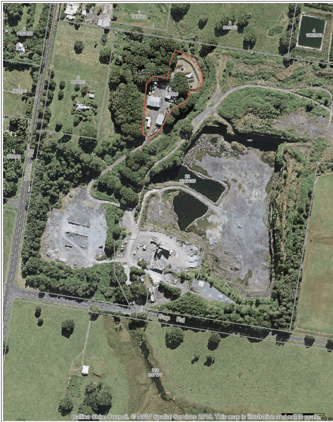
Ballina Shire Council. This map is illustrative and not to scale. 80 m

Ballina Shire Council 40 Cherry Street BALLINA NSW 2478