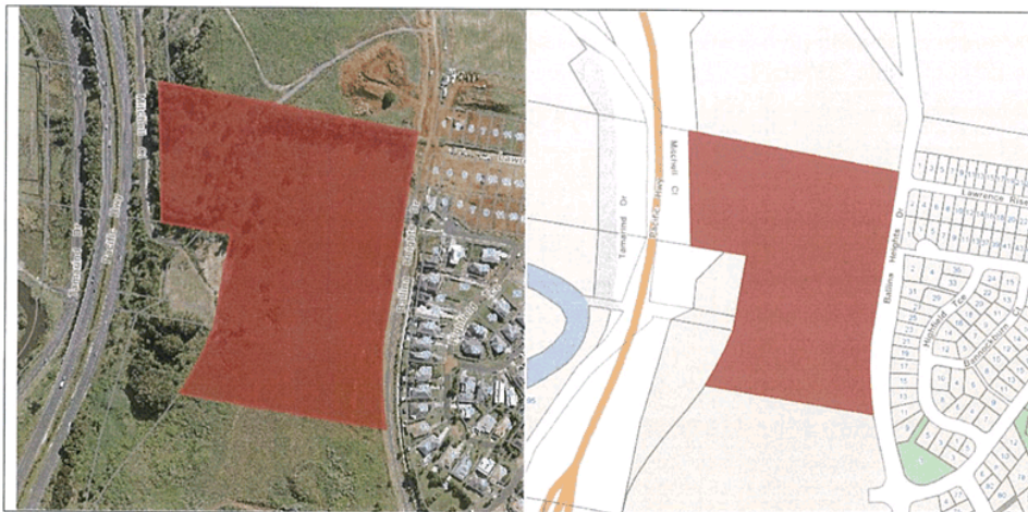
Figure 1: The subject land, outlined in red

This planning proposal applies to Lot 1 DP 1077982, Mitchell Close, Cumbalum, as shown outlined in red within Figure 1 below.