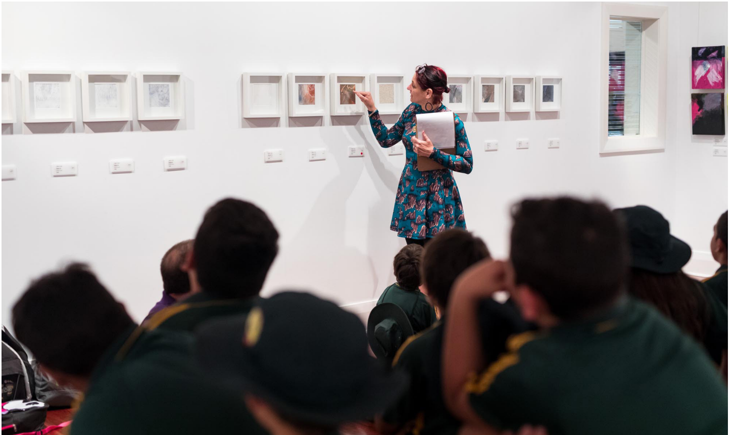
Images: Schools Arts and Literacy Program in the Gallery, Cabbage Tree Island Public School visit.