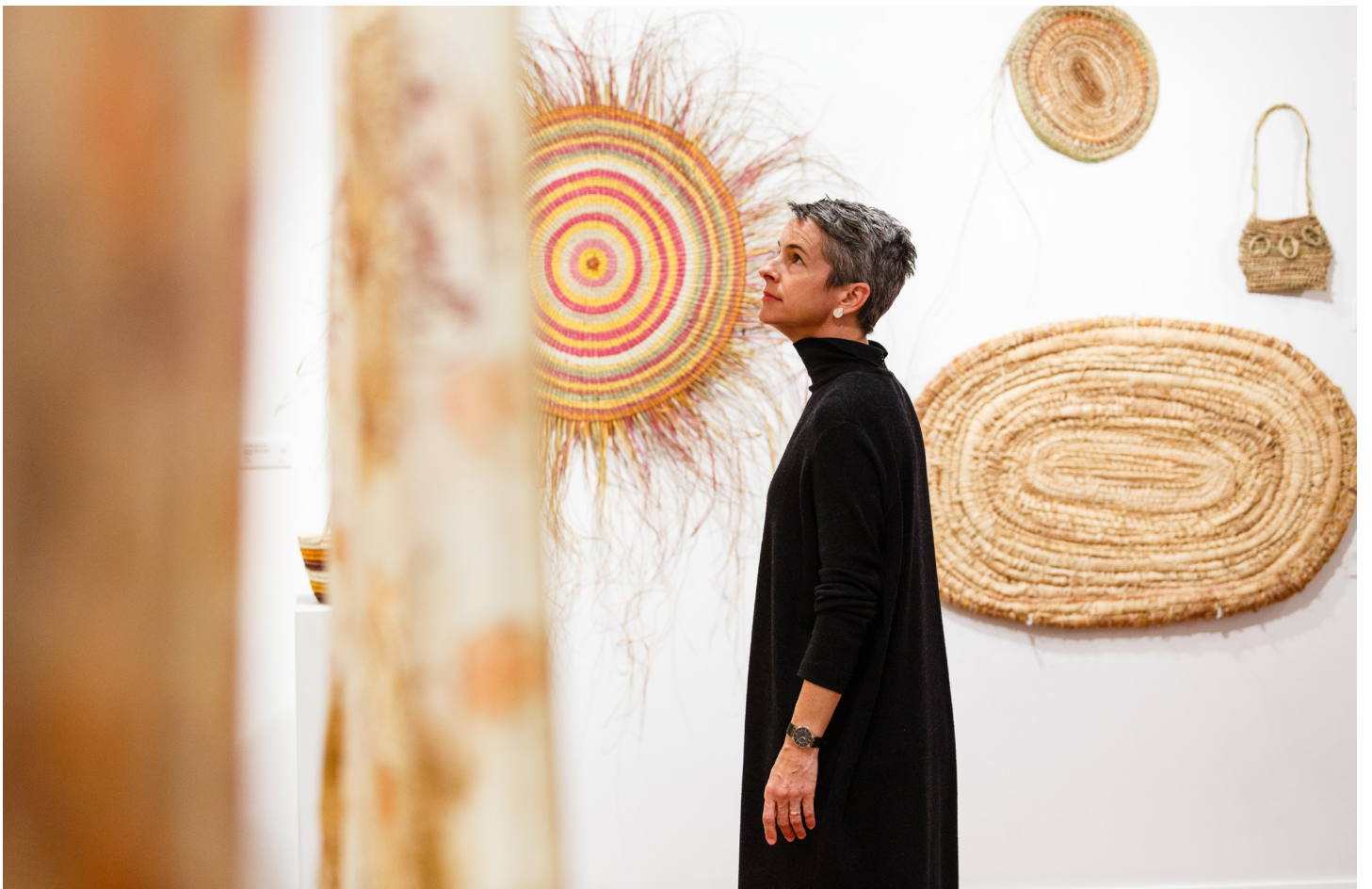
/images: Casino Wake-Up Time and Kuwinjku Women's Group Exhibition