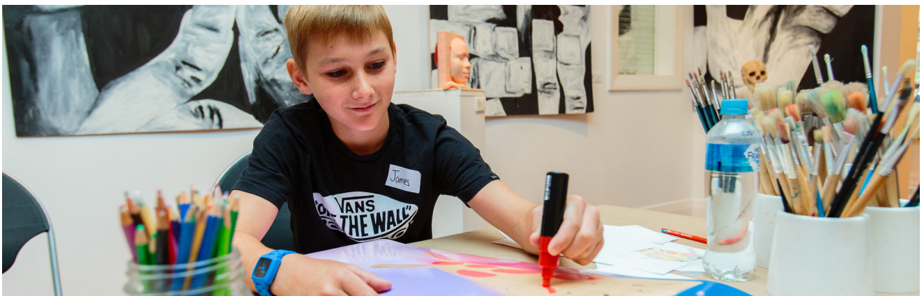
image: (left) Five Writers Road Trip Event - Byron Writers Festival Partner program; (above) Bright Sparks - Deck Art Kids Workshop

Future planning should set out a coordinated approach for the development of cultural infrastructure and resources across the shire, ensuring a cost effective, strategic approach to arts and cultural development.