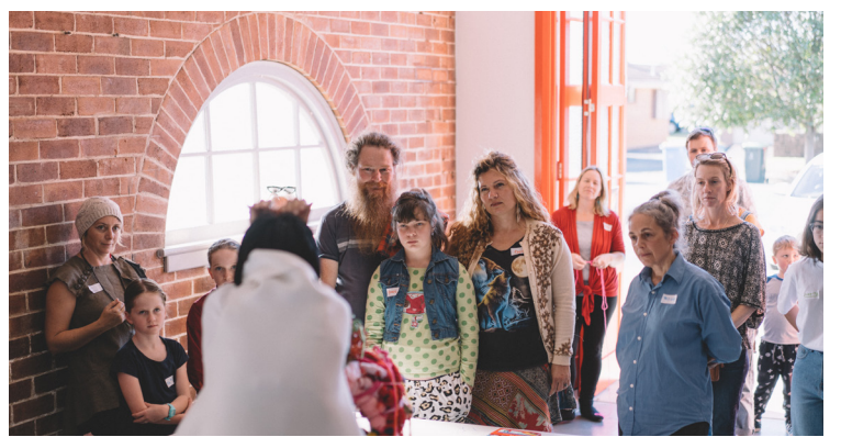
Images: (top bottom right) Hiromi Tango Collaborative Community Art Workshop at Ignite Studios (Splendour in the Grass Arts program) (bottom left) Sprung!! Integrated Dance Theatre - Live performance - Ignite Studios