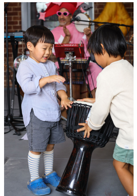
Image: (left) Picturing the Past - Creative Youth Heritage exhibition in the Gallery; (right) Monkey Monkey, Shake Shake live performance in Ignite Studios