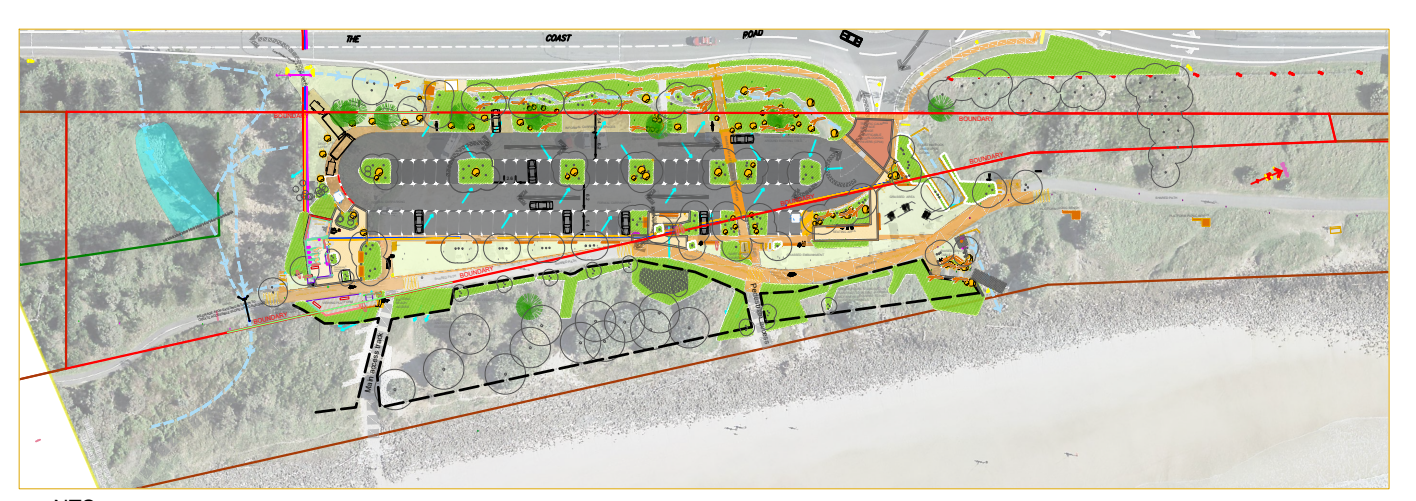
FULL EXTENT OF LEASE WITH SOUTHERN AND NORTHERN BOUNDARY HIGHLIGHTED

Underground, sewer, water, electical services. refer civil drawings