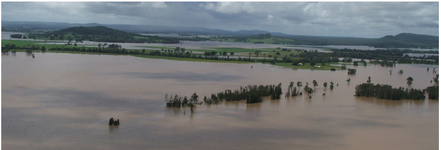
Image: Deep inundation of the floodplain during 2008 major flood.