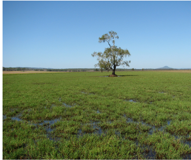
Image: A typical, low lying floodplain backswamp.