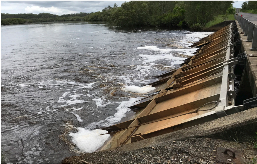
Image: Blackwater discharging into the Tuckean Broadwater.