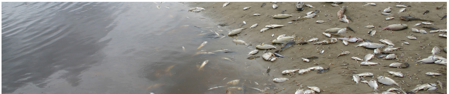
Image: Dead fish at Ballina after flooding in 2008.