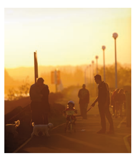
ballina shire council

ballina.nsw.gov.au council@ballina.nsw.gov.au Phone 1300 864 444