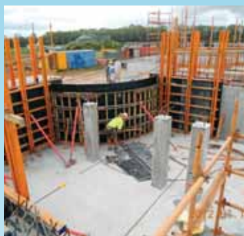
Ballina Wastewater Treatment Plant - Inlet Works Curved Vortex Formwork

A major component of the Master Plan is the construction of the recycled water treatment plants at both Ballina and Lennox Head. The construction works are now well underway and progressing quickly.