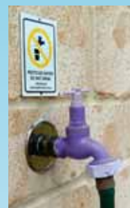
The lilac recycled water tap

When recycled water delivery begins we all need to know how it can and cannot be used.