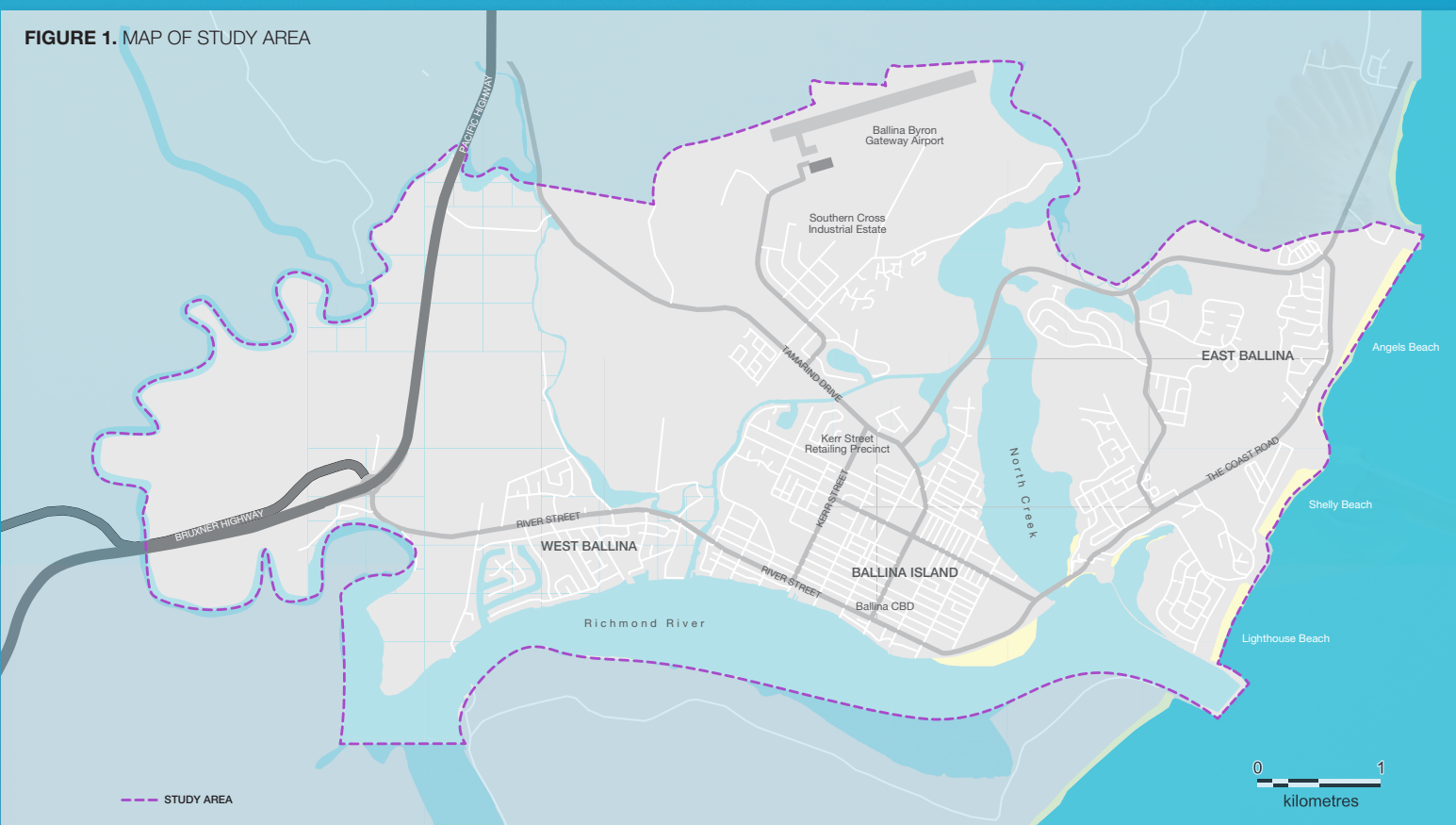
FIGURE 1. MAP OF STUDY AREA

The strategy identifies key drivers of change, opportunities and key challenges over the next 20 years and proposes a series of actions that may be taken to respond to change in a proactive and positive manner.