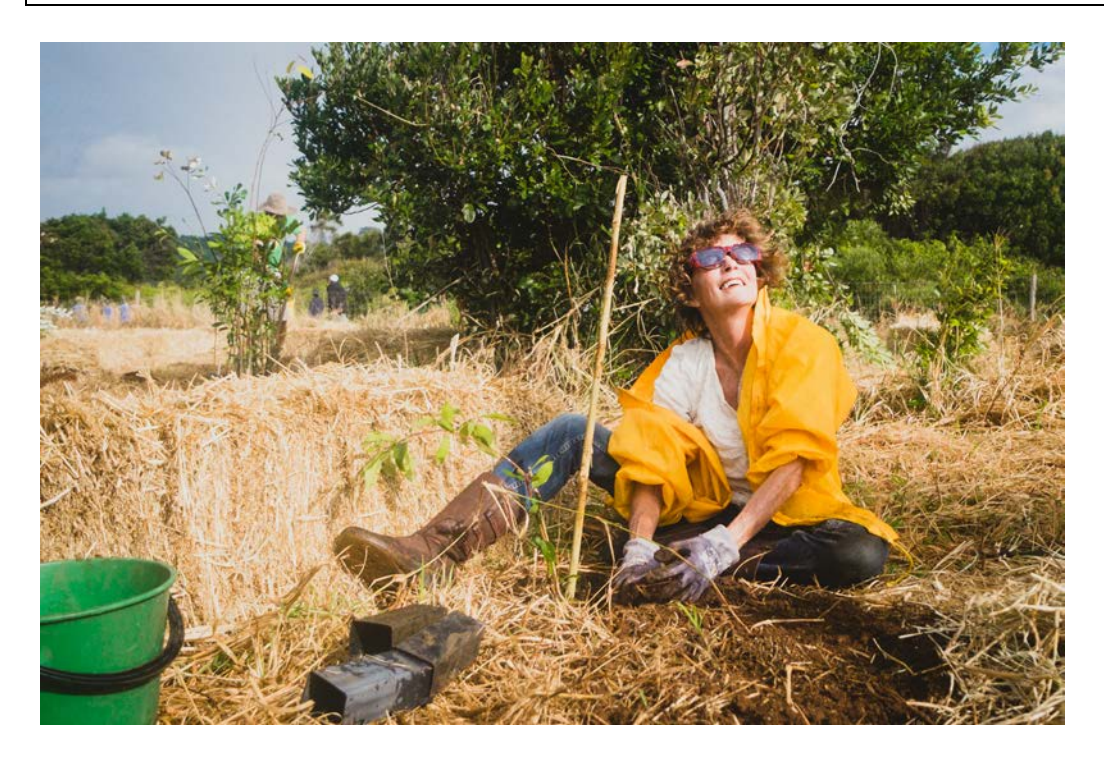
Image 1: 2016 Tree Planting Day