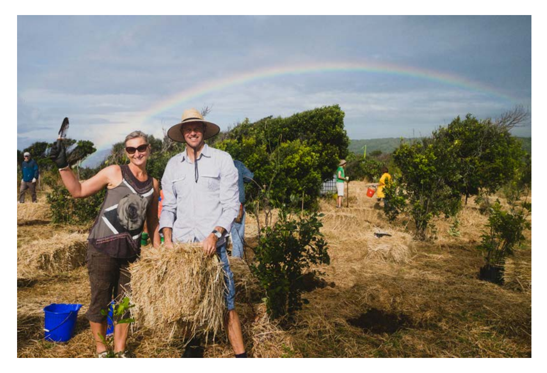
Image 2: 2016 Tree Planting Day (photo credit: Tony Partridge for Ballina Shire Council)

Image 1: 2016 Tree Planting Day (photo credit: Tony Partridge for Ballina Shire Council)