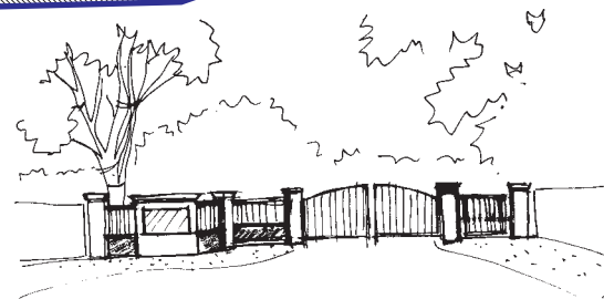
FRONT ENTRANCE SIGN AND GATE (1)

Prepared By GeoLINK Date : August 2006 UPR : 0569822