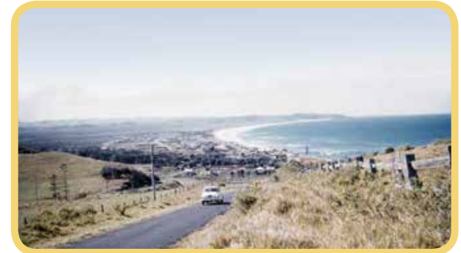
Photo credits top to bottom: Travelling north and overlooking Lennox Head, c. 1960s ( Image Ballina Shire Council ); Main Street Alstonville, c. 1940s ( Image Ballina Shire Council ); Meerschaum Vale School Picnic, c. 1900 ( Image Blackwall Historical Society ).