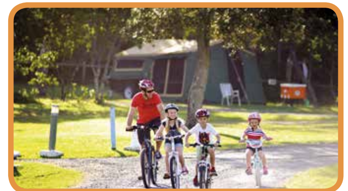
Family at the Spit, Ballina; Rivafest, Fawcett Park, Ballina; Enjoying Ballina's great outdoors, East Ballina.