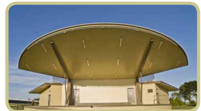
Photo credits top to bottom: Wardell and District War Memorial Hall ; Northern Rivers Community Gallery ; Ballina Amphitheatre.