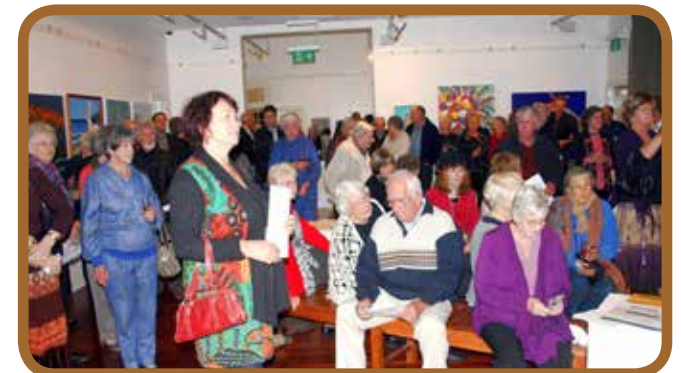
Photo credits top to bottom: Busker at Lennox Head community markets ( Image Ballina Shire Council); People of the Reeds, Cabbage Tree Island ( Image Frangipani Creative with permission from Arts Northern Rivers); Ballina Arts and Crafts Centre Inc. opening of the Grace Cruice Memorial Exhibition, 2013, Northern Rivers Community Gallery, ( Image Ballina Arts and Crafts Centre Inc).