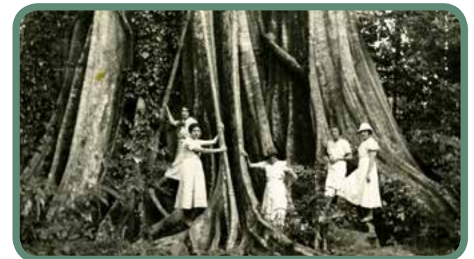
Lake Ainsworth, Lennox Head, c. 1950s; Walking Group, Richmond River, Big Fig, Victoria Park, Alstonville, c. 1930s.