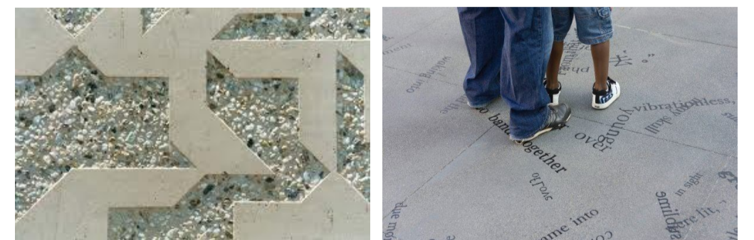
Images of sandblasted concrete and pavement art

The foreshore pathway could contain panels with information themed around the surf culture in Lennox Head. For example, the names of prominent local surfers, the local names for surfing locations ('The Reef', 'The Point' etc.), surfing terminology and so on.