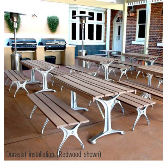
Table Model: UT11 (wheelchair accessible) Bench Seat Model: BS1 Battens: Duraslat Grey (composite hardwood and non-toxic PVC) Upper support and legs: Powdercoated cast aluminium (Dulux 'Citi Pearl') Mounting: Surface mounted

Manufacturer: Botton & Gardiner Skatestoppers are available as a plant attachment.