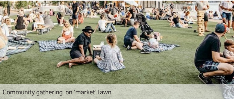
Community gathering on 'market' lawn