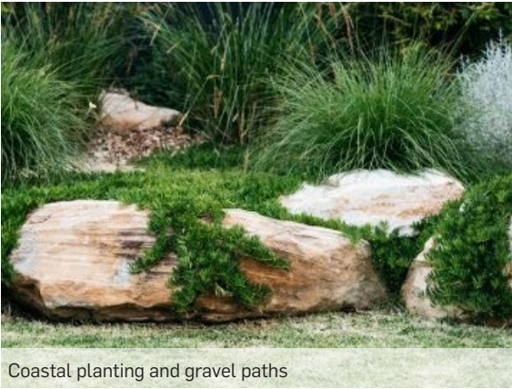
Coastal planting and gravel paths