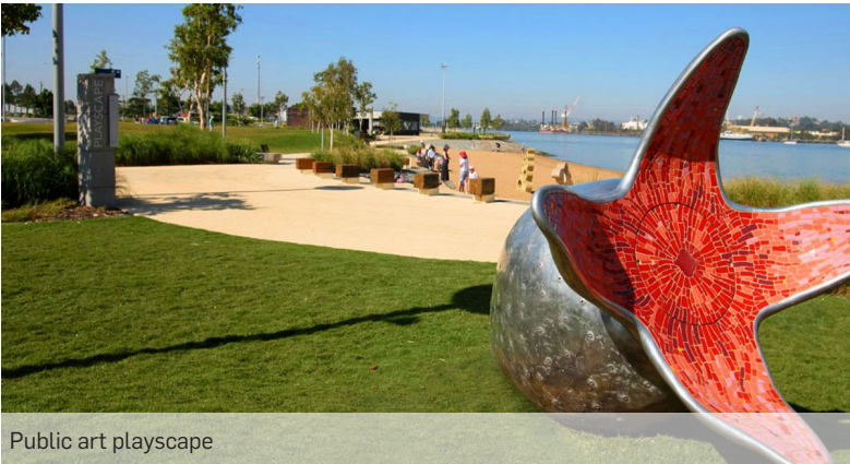
Public art playscape