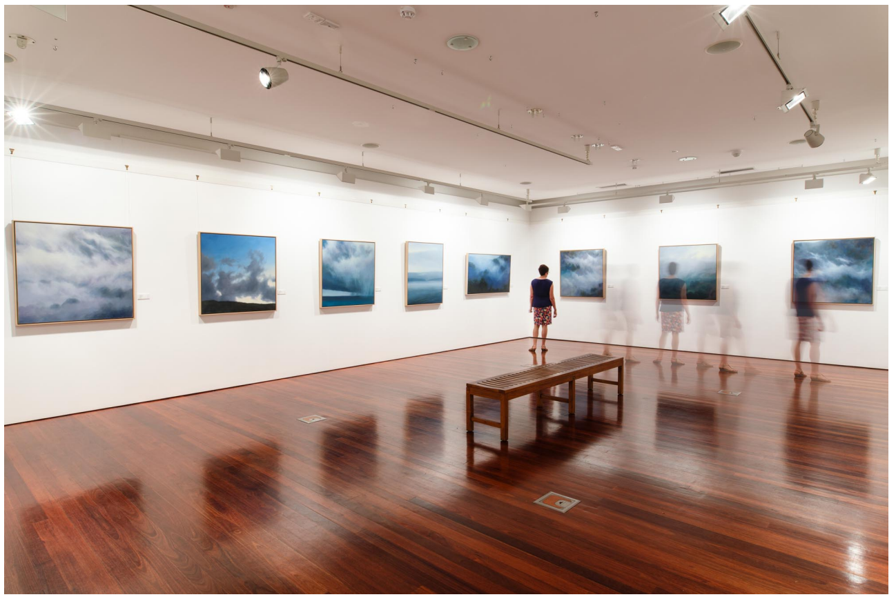
Image 1: Exhibition by Lynne Wallis, 2018 – Northern Rivers Community Gallery.