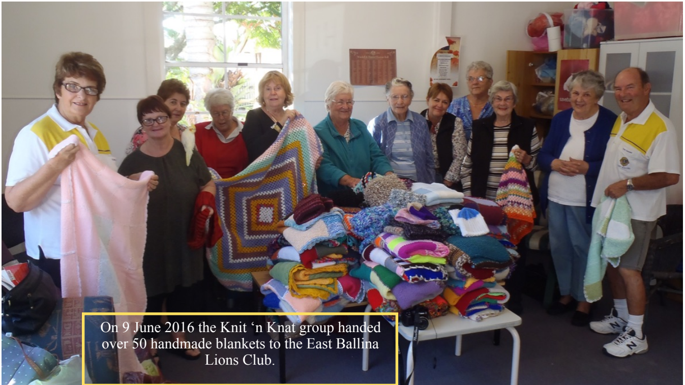
On 9 June 2016 the Knit 'n Knat group handed over 50 handmade blankets to the East Ballina Lions Club.