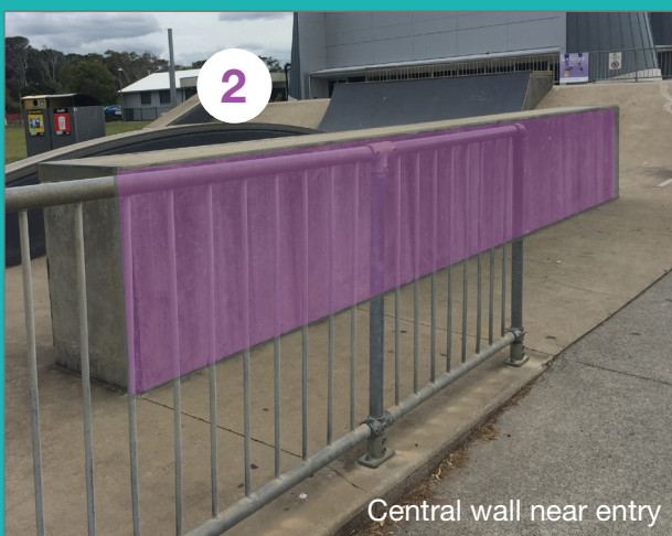
Central wall near entry