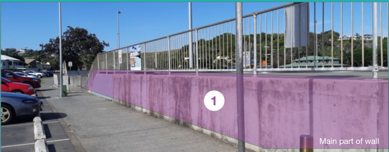
Main part of wall