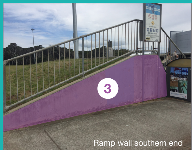
Ramp wall southern end