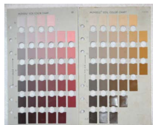
Figure 2. Two pages from the Munsell Soil Color Chart